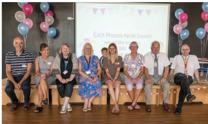
East Preston Voluntary Service – the coordinators.

Friendships created in times of absolute pandemic hardship were celebrated in this much lighter atmosphere and a great social occasion was enjoyed by all those present.