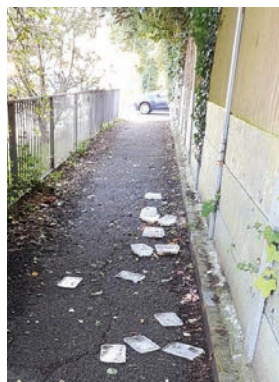
Several times a week, KEPT volunteers are confronted with this.

There will always be litter, but we believe the less litter left lying around the less inclined others will be to add to that litter. There will also be cars speeding but again we believe the fewer drivers that speed the less inclined others may be to speed through our village.