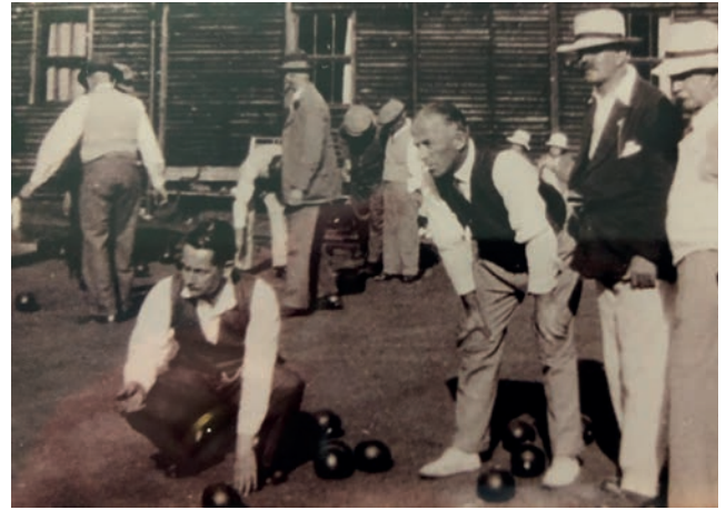
East Preston & Kingston Bowls Club – the early days

For further information http://www.epkbc.org.uk