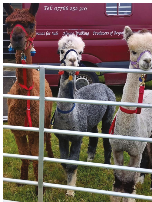
Alpacas visiting the Village Green in 2024

Please support as many Festival events as you can. The Festival is run by a very small team of very dedicated volunteers and the council thanks each and every one of that team.