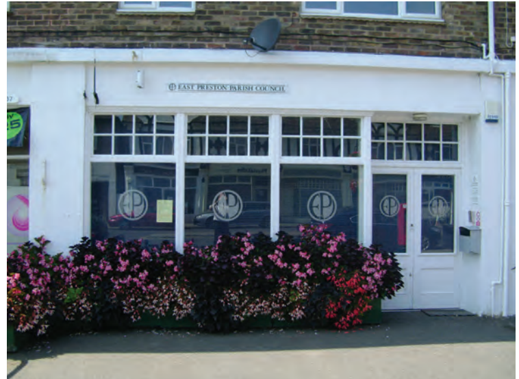
New Council Office, 122 Sea Road, East Preston

On the 26th April, we completed the purchase of 122 and 124 Sea Road as the new Council Office with a one-bedroom flat above. The Council Office is comprised of two separate offices, a meeting room, a kitchenette and a wc. The purchase price of £270,000 was funded partly from reserves with the balance coming from a £125,000 Public Works Loan Board loan. This is repayable over ten years, and the first six-monthly payment has already been made.