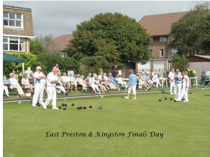
East Preston & Kingston Finals Day

We pride ourselves on keeping our green in good order and