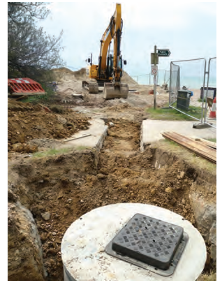
Sea Lane : New catchpit between soakaway (on the beach) and newly piped ditch

Please contact the Council Office for further information.