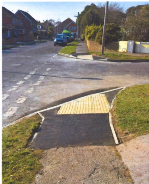
New dropped kerbs at the junction of Normandy Lane and Seaview Road.

New dropped kerbs appeared at the southern end of Normandy Lane on about 21 st February and those at the western end of Vicarage Lane were improved at about the same time.