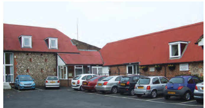
Another busy day at the Village Hall

Keeping this all running in an 18th century barn is, however, expensive! The Hall has a turnover of around £35,000 per year and needs about £22,000 for running costs, excluding refurbishment and replacement of assets. The Executive Committee has been carefully putting away the surplus and currently estimates that it can cover expected expenses for the next 20 years, the exception being the roof, which hopefully will not turn into a problem!