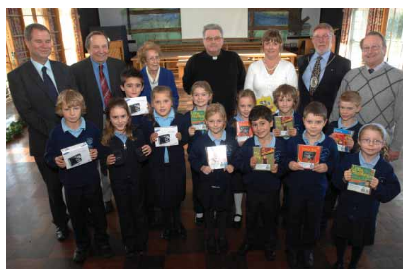
Reproduced with the kind permission of the Littlehampton Gazette, pictured are pupils from both schools, trustees, Headteachers and Councillors.

Potholes should be reported direct to West Sussex County Council, either via its call centre on 01243 642105 or online at www.westsussex.gov.uk/ccm/content/roads-and-transport/forms/report-a-fault. en. Other matters that can be reported through the call centre include faulty streetlights and traffic lights, pavement problems and flooding.